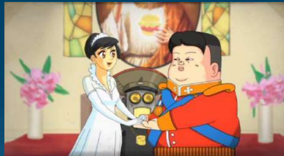
Sample (not real footage)