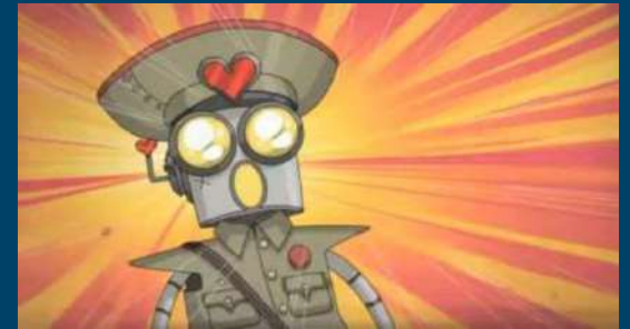
Sample (not real footage)