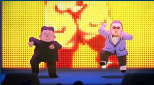
Sample (not real footage)

We are currently working on a pilot that will be used to pitch to big media networks such as Funny or Die and Comedy Central for an 8 to 12 part animated series to be released at the end of 2021!